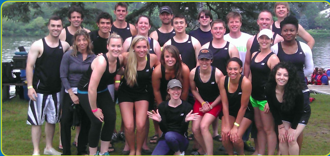
CHEO fitHeads team at the 2013 Ottawa Dragon Boat Festival.